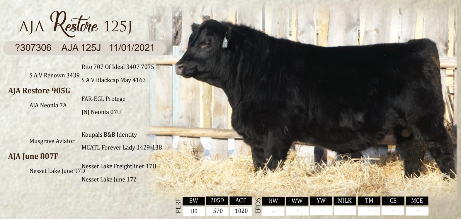
125 exhibits tremendous rib shape, strong top, square hip and is very husky looking. Easier type bull for leshing ability, still having adequate frame. Backed with his Aviator dam his calves should have lots of dimension, be good footed and have a great disposition. Registration pending DNA parent veri ication requirement

Performance, eye appeal, sound footed length of spine backed by maternal potency are the irst few words that come to mind when I think of 123. Another Renown son that checks all the boxes. His Motive dam stands very correct on a sound foot she exhibits a perfect udder all in a very neat and very feminine package. 123 doesn't give his place in the pen when it comes to either of the descriptions listed above. Watch for him!!!