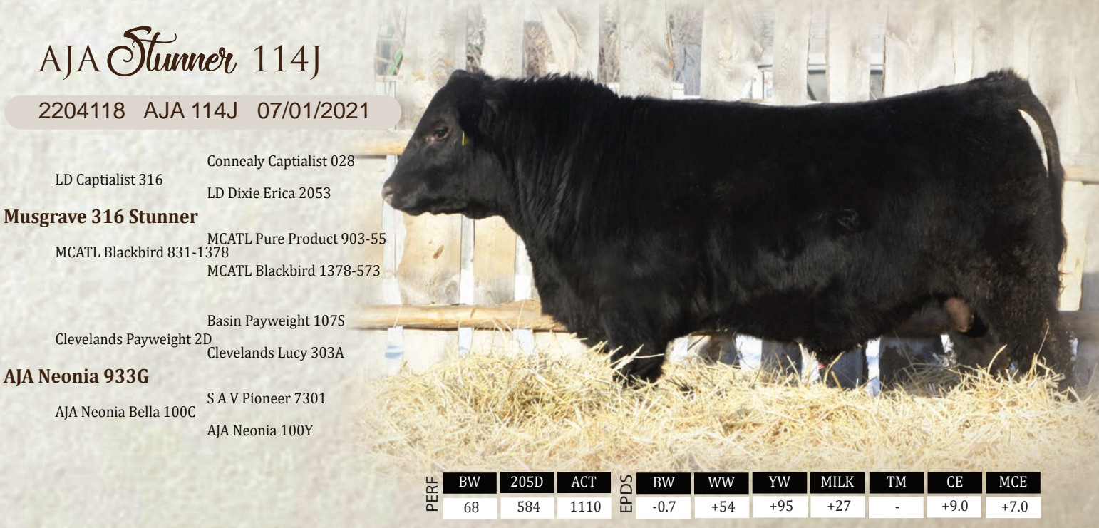
This Stunner son does not disappoint if your looking for a calving ease bull. With a birth weight of 68 lbs, 114 combines true muscle shape, depth and width. He has a very strong top line, showcases huge presence and is a very attractive individual.

108 is a calving ease special with a +0.4 bw epd, +7.0 ce epd and is on a fast track to stardom!!! Sired by the famous Musgrave Stunner you can be sure 108 will be unmatched for breed character, muscle shape and expression of huge dimension. He is very sound in his structure and exhibits a very gentle disposition.